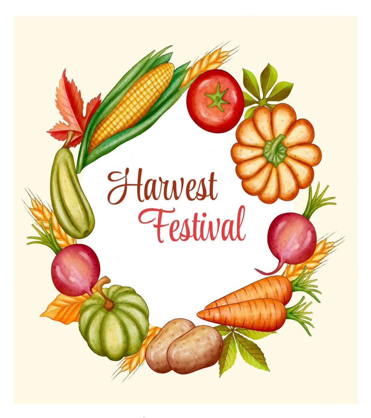
Sunday 15th September at 11.15am

We warmly invite you to come and share in our Harvest Festival Service and BBQ at St Leonard's.